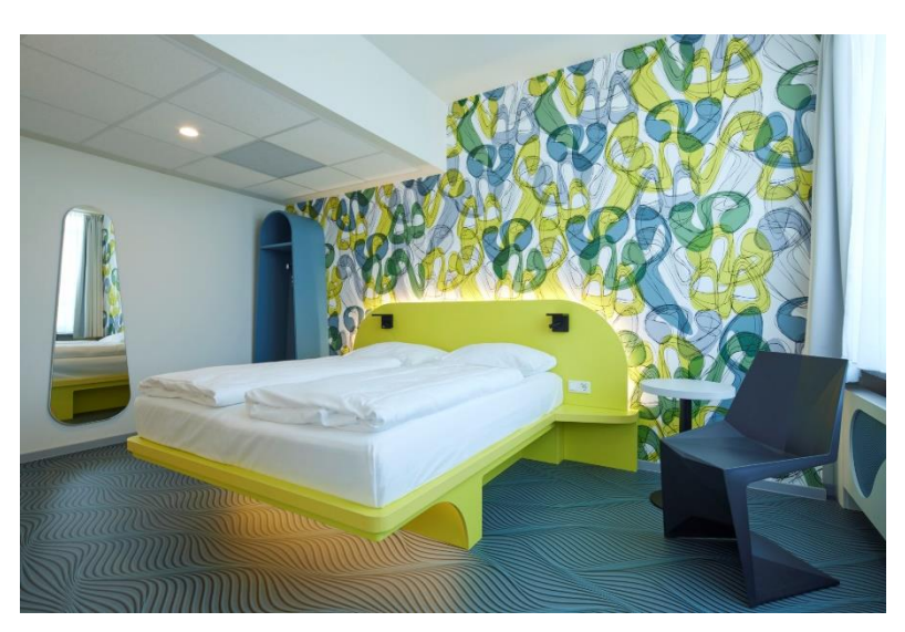
Image 7: The hotel rooms were designed by Karim Rashid and combine 1950s design with contemporary style.

Download texts and images: www.hoermann.de/presse