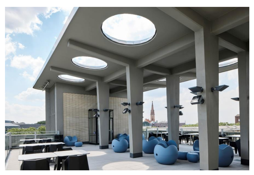
Image 5: The roof terrace offers a wide view over the city of Dortmund.

Download texts and images: www.hoermann.de/presse