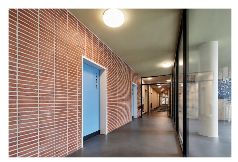
Image 6: The hotel corridors have kept the atmospheric "public authority" charm after the renovation.