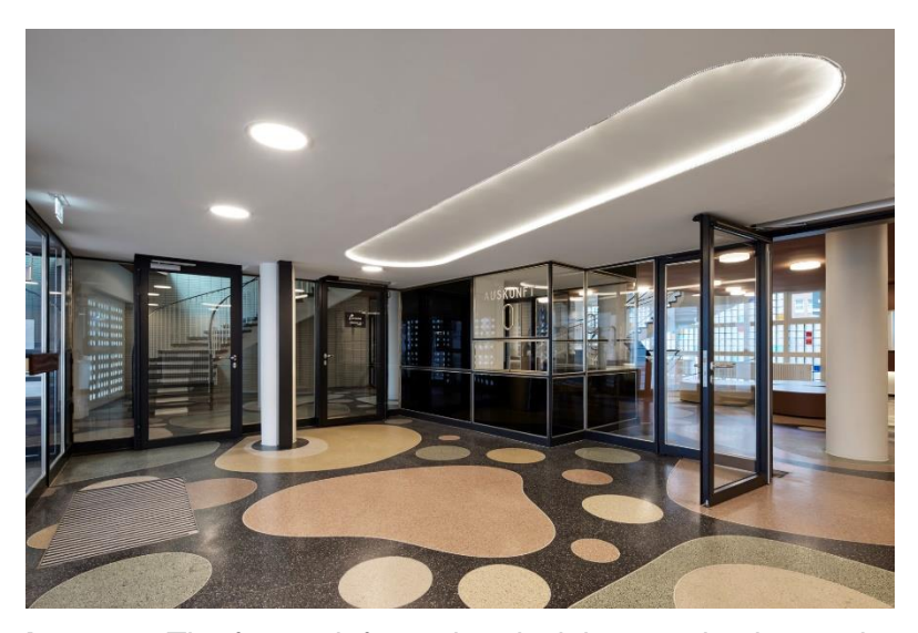
Image 3: The former information desk is now obsolete as it wasn't big enough for the reception area of the "Prizeotel".

Download texts and images: www.hoermann.de/presse