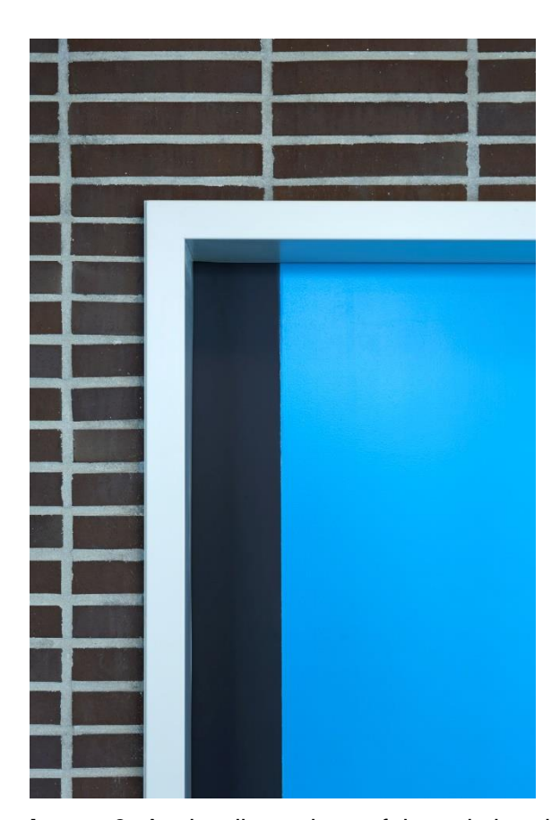
Image 9: As the dimensions of the existing doors all varied by a few millimetres, Hörmann had to make each of the new steel frames as a one-off.

Download texts and images: www.hoermann.de/presse