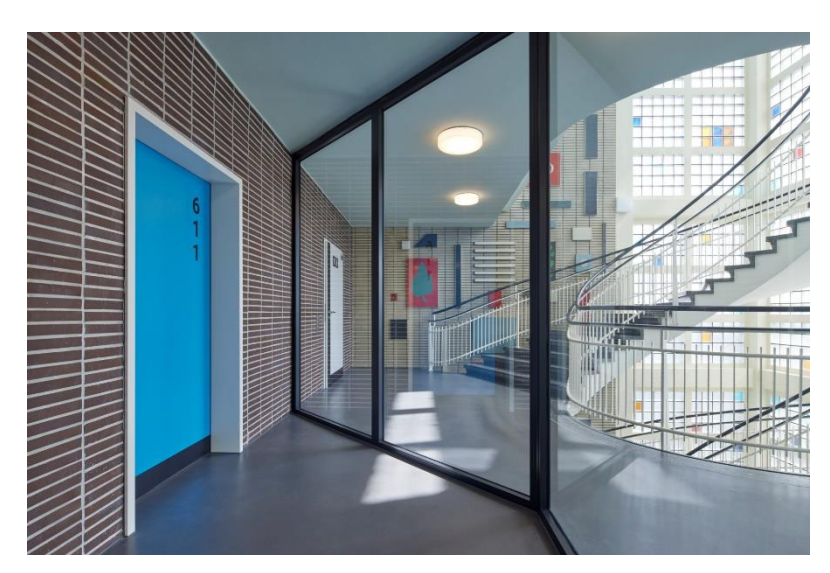
Image 8: The aim was to keep the existing doors as far as possible. New door frames had to be custom-made by Hörmann and fitted individually for this purpose.