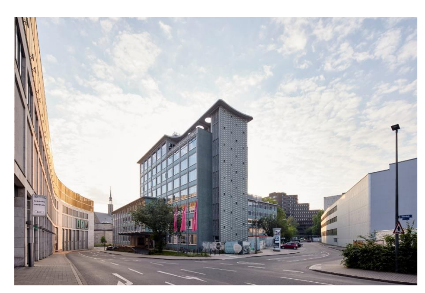
Image 1: The "Gesundheitshaus" in Dortmund was renovated and revitalised: The building from the 1950s now has a variety of uses, including a hotel. Hörmann supplied customised steel frames for the renovation.

Prizeotel in Dortmund by pinkarchitekten and HLK + Partner Positive outlook